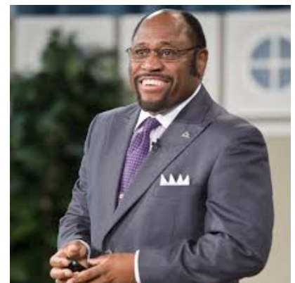
Dr. Myles Munroe (1954 - Nov. 9, 2014)